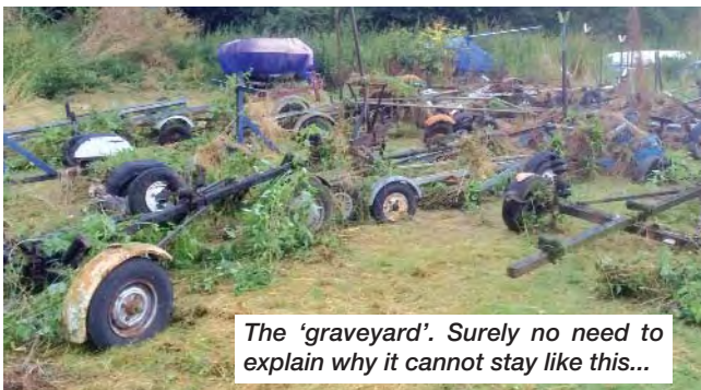
The 'graveyard'. Surely no need to explain why it cannot stay like this...