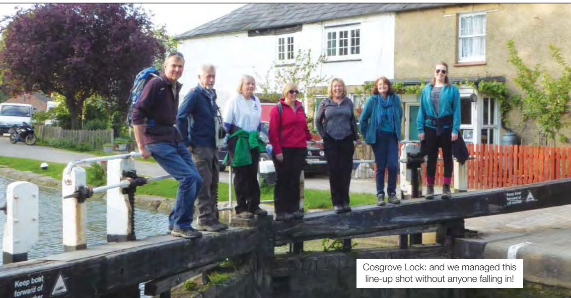
Cosgrove Lock: and we managed this line-up shot without anyone falling in!

Now we're back to Saturday mornings which means we can increase our distance a bit, which turns out to