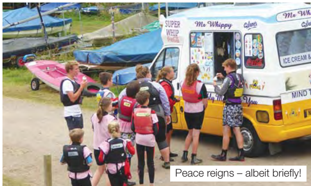
Peace reigns – albeit briefly!